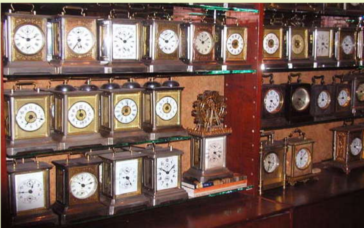
The bottom left displays a variety of carriage clocks.