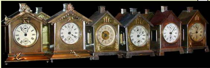
Figure 2: Left and two right most are Seth Thomas. Second, third and fourth from left are Junghans