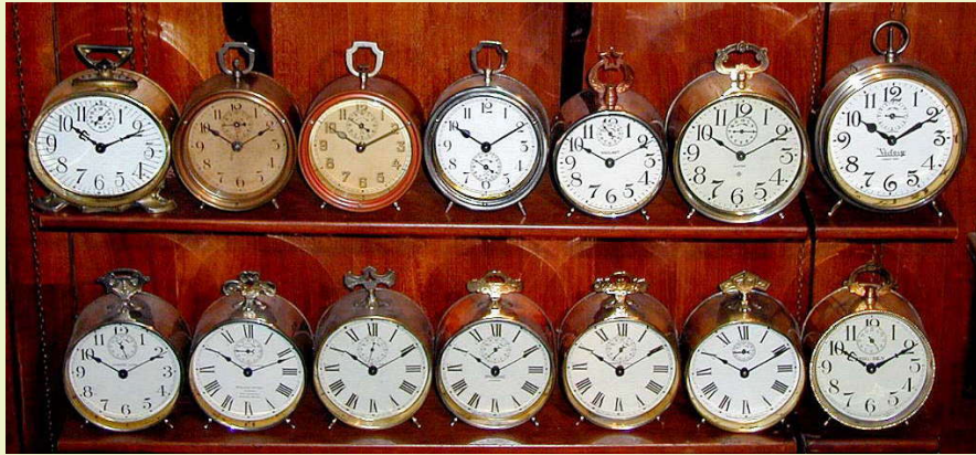
Figure 3: Top Row (left to right): First is oval Starkey, second, third and fourth are HAC. Waterbury is fifth, Ansonia is 6th and Ingraham 7th.